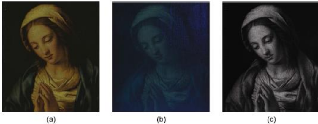
Figure 1(a) Visible photograph of the Madonna in Preghiera , (b) UV Fluorescence Image, and (c) IR Reflectography Image.

A typical THz time-domain system (Teraview TPS Spectra 3000) is employed in this study. The GaAs photoconductive antenna is excited by an ultrafast laser to produce roughly single-cycle THz pulses with bandwidth extending from 60 GHz to 3 THz. The maximum peak of its power spectrum is located at about 0.3 THz. The focus spot size of the THz beam is frequency-dependent, and is about 300\ \mu\text{m} at 1 THz.