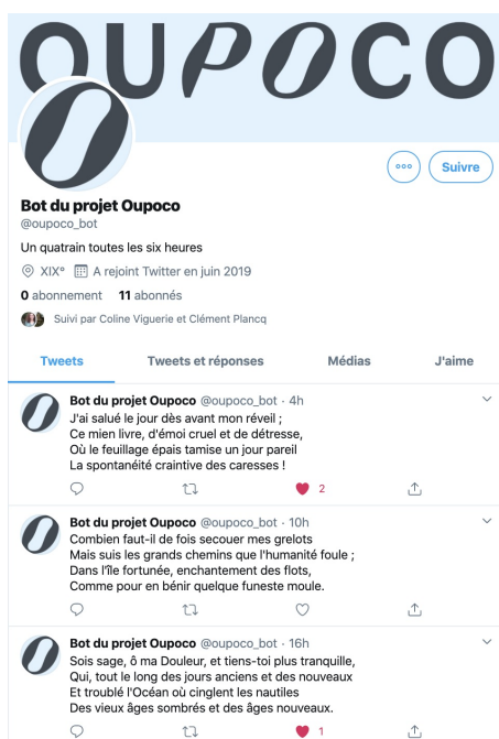
Figure 2: The Oupoco bot on Twitter

events (based on Raspberry Pi components). Through these devices our goal is to reach a wider audience and engage people to reconnect with poetry.