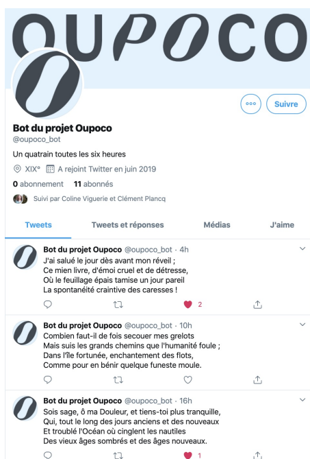
Figure 2: The Oupoco bot on Twitter

events (based on Raspberry Pi components). Through these devices our goal is to reach a wider audience and engage people to reconnect with poetry.