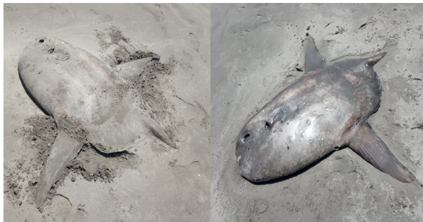
Figure 2. Masturus lanceolatus stranded on the beach at Cerro Negro, Peru. Before (A) and after (B) cleaning.