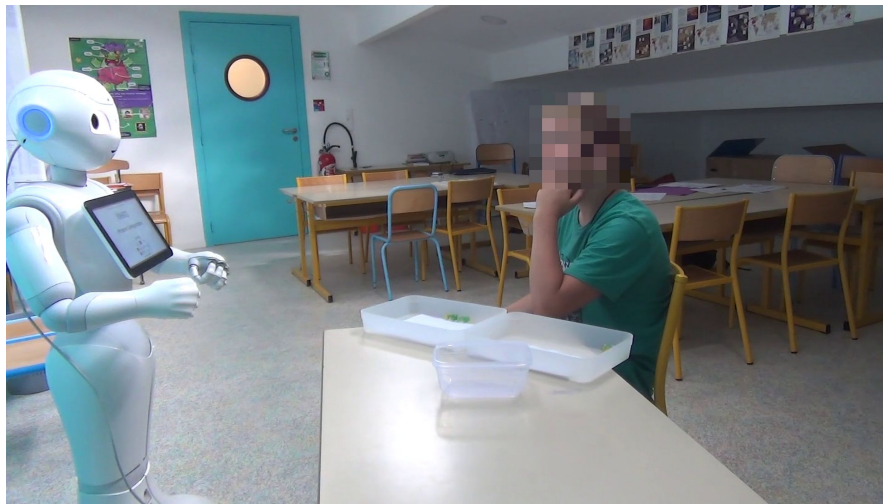
Fig. 1 Child volunteer engaged in a conversation with the robot Pepper

The design of the experiment consisted of a child interacting with a conversational partner for approximately 5-10 minutes. Children's age ranged from 5 to 10 (that is all the primary school levels). To observe the bias a child may display towards robots, volunteers were equally divided into 3 groups, corresponding to a balanced distribution in terms of age and gender. Each group was paired with a different conversational partner : (1) with a humanoid robot (Pepper from Softbank Robotics), (2) with a speaker (Google Home, adapted to the task) and (3) with a human (a PhD student participating in the project, aware of the experiment but working on a different topic than human-machine dialog).