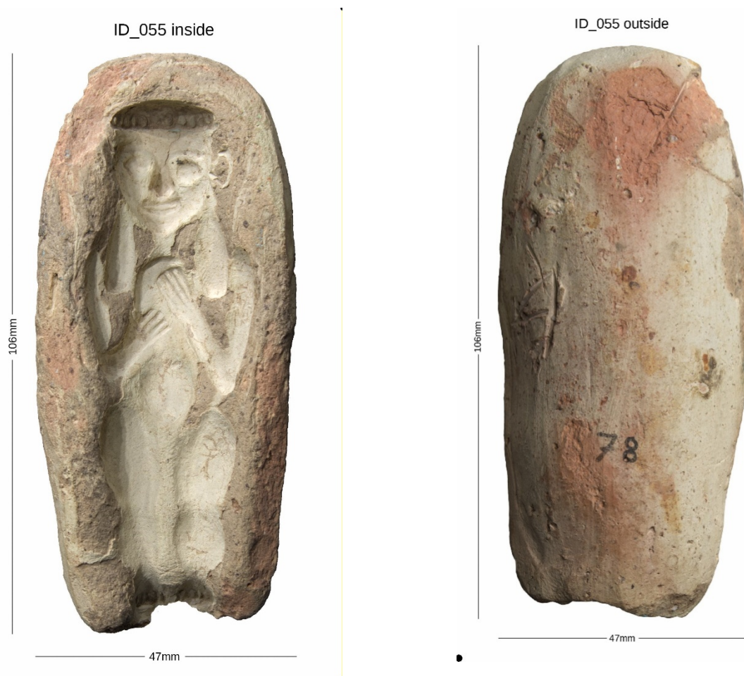
Fig. 3–4: Mold (on the left: inside [impression in hollow], on the right: backside, with the incised letter “b”, probably a potter’s mark), Karak region; 106 x 47 c 23 mm; Karak Archaeological Museum, Jordan, © Department of Antiquities Amman via FGFP/photo: T. Graichen.

The manufacture of a univalve clay mold is a simple impression of an existing figurine, the prototype. The making and use of a mold are a procedure in three steps: <490>