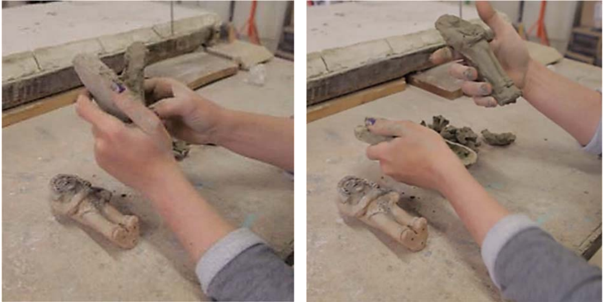
Fig. 9–10: above left: Continuing to take out the cast from the mold; above right: The moist cast is ready to be finished by hand; Experimental Archaeology Workshop Strasbourg 2015, For more pictures concerning the steps described see https://vimeo.com/150722204 (accessed Dec. 5, 2018).

This procedure in three steps that makes a clay mold to produce a replica of an existing prototype corresponds approximately to the three steps in Gen 2:21b–22a, in which Yhwh God is occupied, in the proper sense, with the shape, the materia and the concept (Woman) of the second phase 62 of the creation of mankind. This divine act can be read in terms of a molding process: