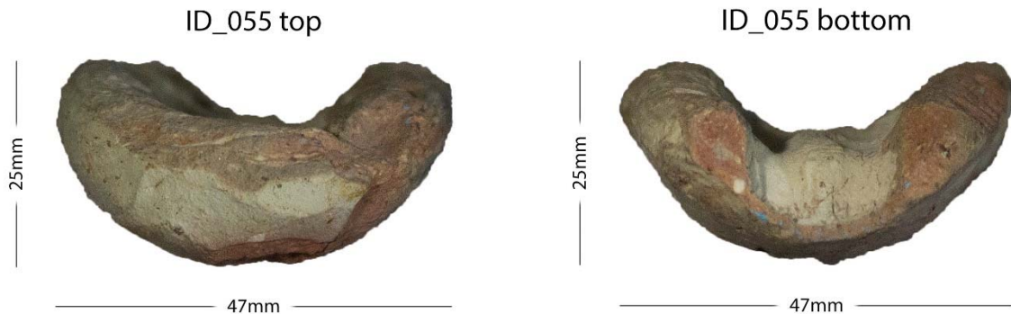
Fig. 5–6: Mold (profile view, on the left: top, on the right: bottom, Karak region; 106 x 47 c 23 mm; Karak Archaeological Museum, Jordan, © Department of Antiquities Amman via FGFP/photo: T. Graichen.

The initial impression (1) is obtained by pressing a slab of moist clay over one of the sides of the prototype. This manipulation will create a negative shape of the impressed side of the prototype in the slab. 61 Once dried or fired, this impressed cavity which mirrors the original in the negative (Fig. 5–6) serves as a mold to create positive casts, i.e. identical replicas of the prototype.