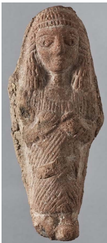
Fig. 1 (left and center): Female figurine, terracotta, Megiddo Stratum IV, Iron Age IIA–B, 128 x 51 x 36 mm, lateral excess of clay trimmed, A19023, © Courtesy of the Oriental Institute of the University of Chicago. 14