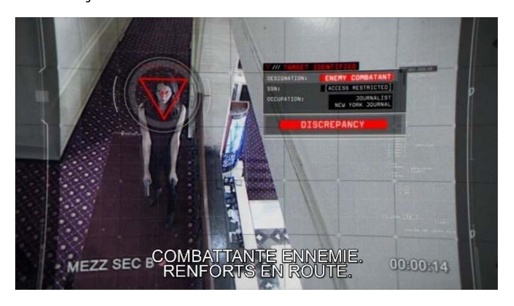
[Fig. 7 and 8]: in S04E05, Root, interfacing with the Machine, and Martine Rousseau, with Samaritan, shoot at each other without even seeing each other: they are tools in the hands of artificial intelligences.

As we discussed, Person of Interest sets the digital world as a top layer of reality, a divine realm; this is made clear through the use of 'God Mode', a term derived from video games where the player is granted god-like powers. The Machine or Samaritan may choose to use "analog interfaces", humans, and direct them with uncanny precision as they see everything : as soon as "God Mode" (S02E22), Reese answers a call from the Machine, which uses recorded voices to direct him, with instructions such as "four o'clock"; when he loses his earpiece, the Machine successfully faxes Reese the detailed weaknesses of the opponents that have captured him, with one of them reading the list aloud without realizing what it is before it's too late (S04E22). As the series slowly adopts Samaritan interface for establishing shots and flashbacks, its own analog interfaces can be seen shooting through walls, hitting targets no human ever could, while shots from surveillance cameras help the audience see how both ASI are reacting and countering the attacks of the other.