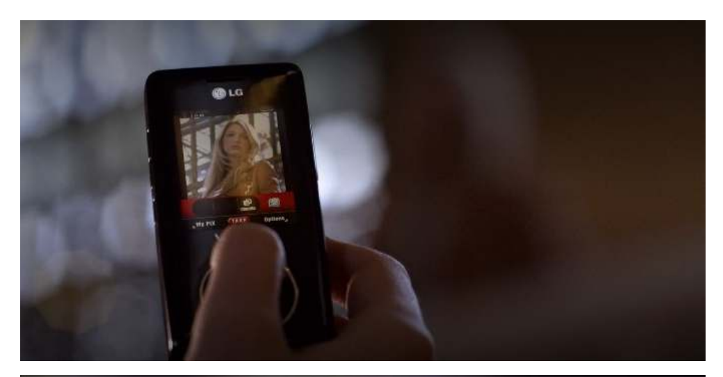
[Fig. 3 and 4] Shots from S01E01 and S01E10 of Gossip Girl: 'Mel' and Chuck Bass sending tips to Gossip Girl, either for gossip or outright vengeance.

Gossip Girl may seem less interested in lower-class characters. During its first seasons, it plays with the opposition between the luxurious Upper East Side and the cozy lofts of Brooklyn. It foregrounds the reformulation of power moves and twisted relationships in the upper-class dynasties of the 21st century, where a single photo can be instantaneously uploaded to a blog, or a sextape may destroy a reputation. While a series like Gossip Girl is focused on what can be seen – especially during the advent of smartphones video cameras – neither voice-overs nor shots make it clear how most of the day-to-day stories end up on the blog – until the series finale outs Dan Humphrey as the titular blogger.