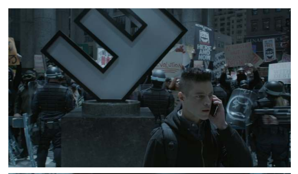
[Fig. 9 and 10] Two shots from Mr. Robot S03E05: protagonists are never in the center of the frame.

seemingly passing through it like a ghost, and joining the server room in which Angela is operating with the exterior, high angle shot of the protesters 400 ft below. This episode, which could be considered one of the most important turning points of the entire series, takes place during another, major event: the U.N. Security Council vote allowing the people's Republic of China to annex the Democratic Republic of the Congo, with brief peeks to a news anchor underlining the possible disturbance in the balance between "world superpowers and impoverished nations". The long take makes it seem like the revolution is finally underway, with both protesters and camera 'breaking into' E. Corp headquarters from the bottom, while nobody is paying attention to the real, counter-revolution happening on the other side of the globe, as China is moving to the next phase of its plan.