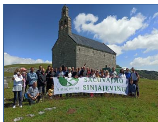
Pastoralists, local community members & Montenegrin citizens supporting the Save Sinjajevina civic initiative August 2020