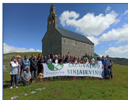
Pastoralists, local community members & Montenegrin citizens supporting the Save Sinjajevina civic initiative August 2020