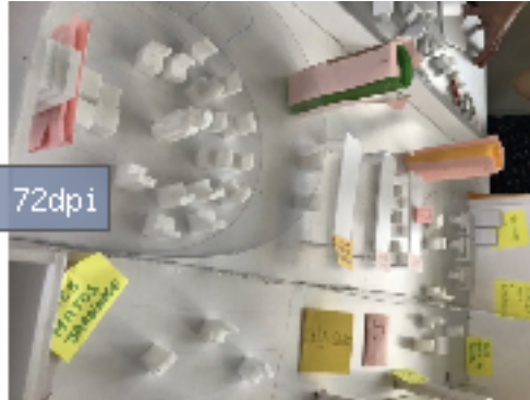
Figure 4 Final model (Left), and mock-up (Right) for the second group

the expected level of precision in a pre-project phase (ideas are instantiated to their concrete form, or even their dimensioning) and, importantly, accepted and internalized by all.