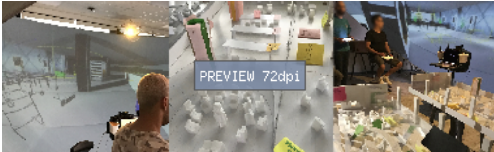
Figure 2 Hyve-3D allowing collective 3D sketching; and rough scaled physical models

library and 1 design accompanists per team) participated in this full-day workshop, divided in four work sessions, each with a duration ranging from 45 to 90 minutes: the first session was focused on analysing the problem, the second on exploring solutions, the third on refining the solutions, and the fourth on finalising the model.