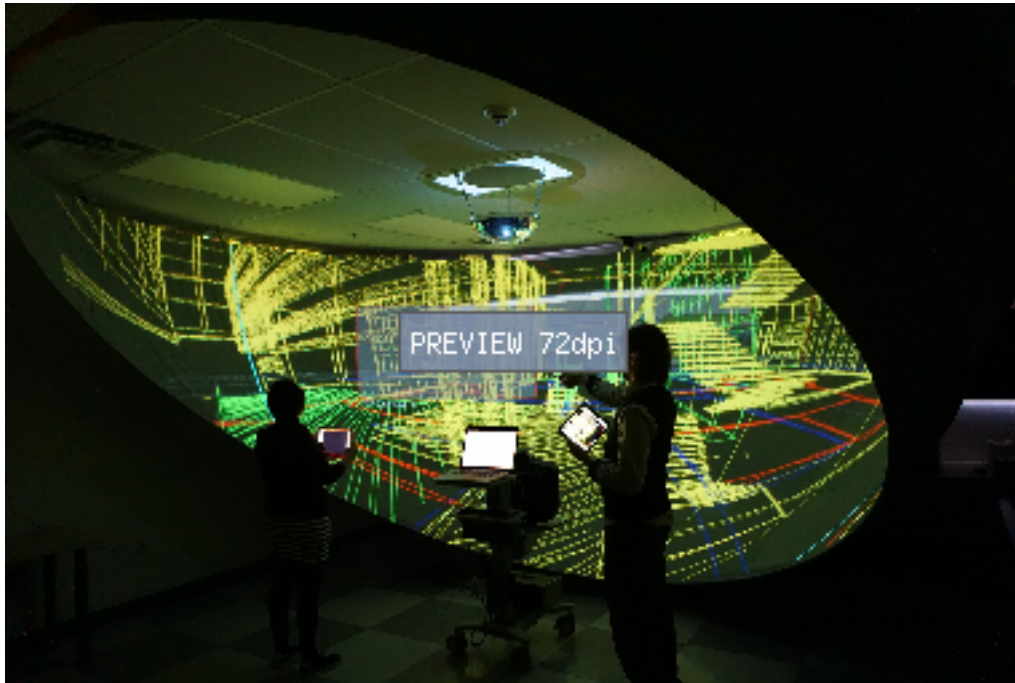
Figure 1 Hyve-3D multi-user immersive 3D sketching

fering with the process, in contrast to traditional CAD tools. It permits to work at different scales (including life-sized) with hybrid representations and to co-ideate in an active way via immersive and 3D sketches and interaction using handheld devices. The system supports the communication between local participants and is considered as “Social VR” because they don’t use occlusive headsets that hinder their verbal and non-verbal communication (e.g. design gestures) allowing to share the collective design experience.