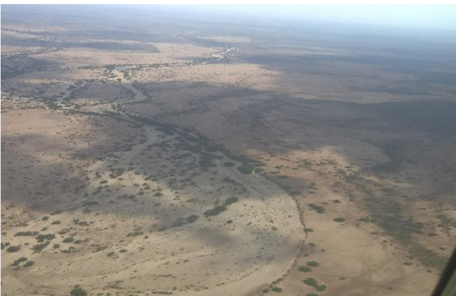
Map1: Map indicating our first area of study in 2016 among the Daasanach, Northern Kenya; Fig. 5: Aerial view of Daasanach riverine ecosystem which is protected by the community

In 2018, we moved to the opposite extreme of the country in South-East Kenya to explore the possible existence of new pastoral commons in the Taita tribe, demonstrating again their important presence, and confirming our first and second hypotheses. In the subsequent section, we present our methods and results in our latest field of Taita that culminated to the conclusion that "Kenya is possibly home to numerous pastoral commons even if underrepresented scientifically, and could be potentially recognized as 'Other Effective area-based Conservation Measures' OECMs).