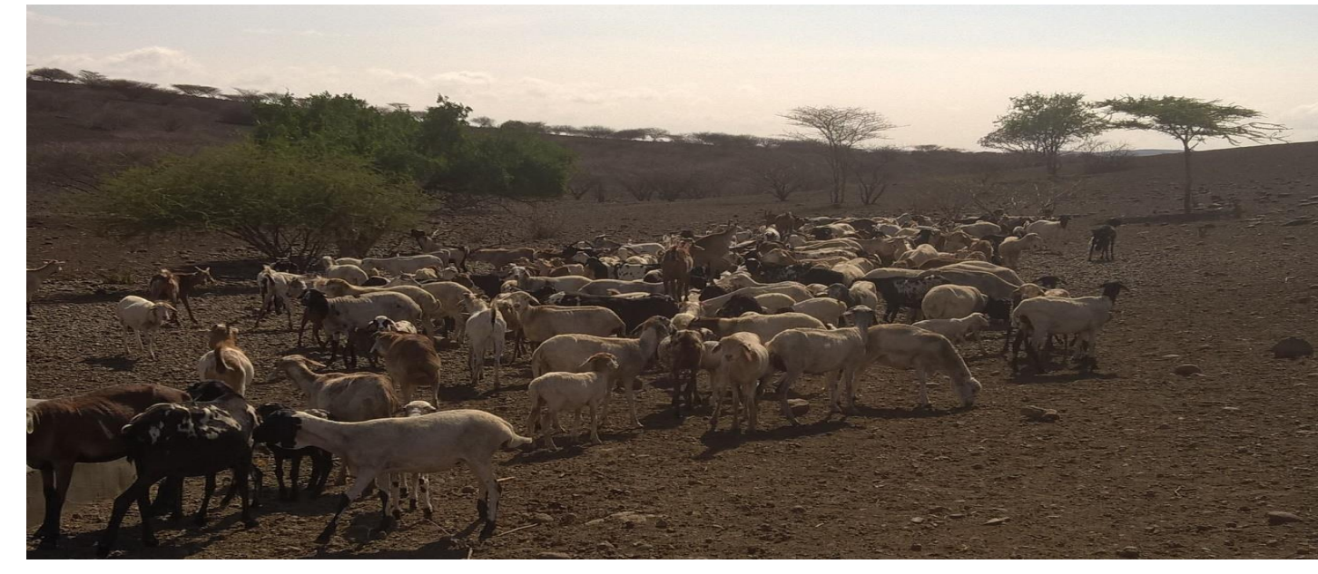
Fig 3 and 4: Livestock on a 'common' salt lick site (Left: Taita, Southern Kenya; Right: Daasanach, Northern Kenya)

Lack of recognition to pastoral commons is linked to the assumption that pastoralism harms the environment through overgrazing because local communities can't manage sustainably (eg. Hardin 1969; Stiles, 1984). Nevertheless, we have seen that pastoralism can contribute environmentally wise (e.g. forest regeneration through seed dispersal by livestock, carbon sequestration, promoting nutrient cycling across tropical savanna, etc. (McGahey et al., 2014). Consequently, we set to test two hypotheses: 1.- pastoral commons exist in an abundant manner in Kenya despite the surprisingly little scientific attention they have received up to now. 2.- inversely as the State thinks, they can support socio-ecological benefits (e.g. environmental conservation, banks of economic resources, cultural identity..).