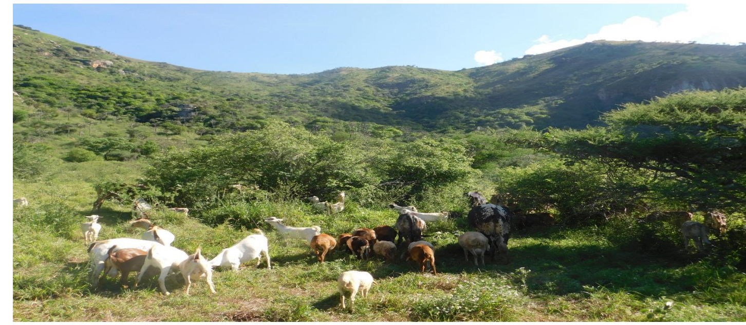
Fig. 1 and 2: Pastoral commons of Mwanda-Marungu in Taita hills, Southern Kenya

Despite emerging interests in ICCAs, few studies in the past dedicated to study pastoral commons, yet pastoralism is practiced in 70% of Kenya's landmass whilst contributing to over 13% of Kenya's economy (Fratkin, 2001), and pastoralism being a typical system for the commons.