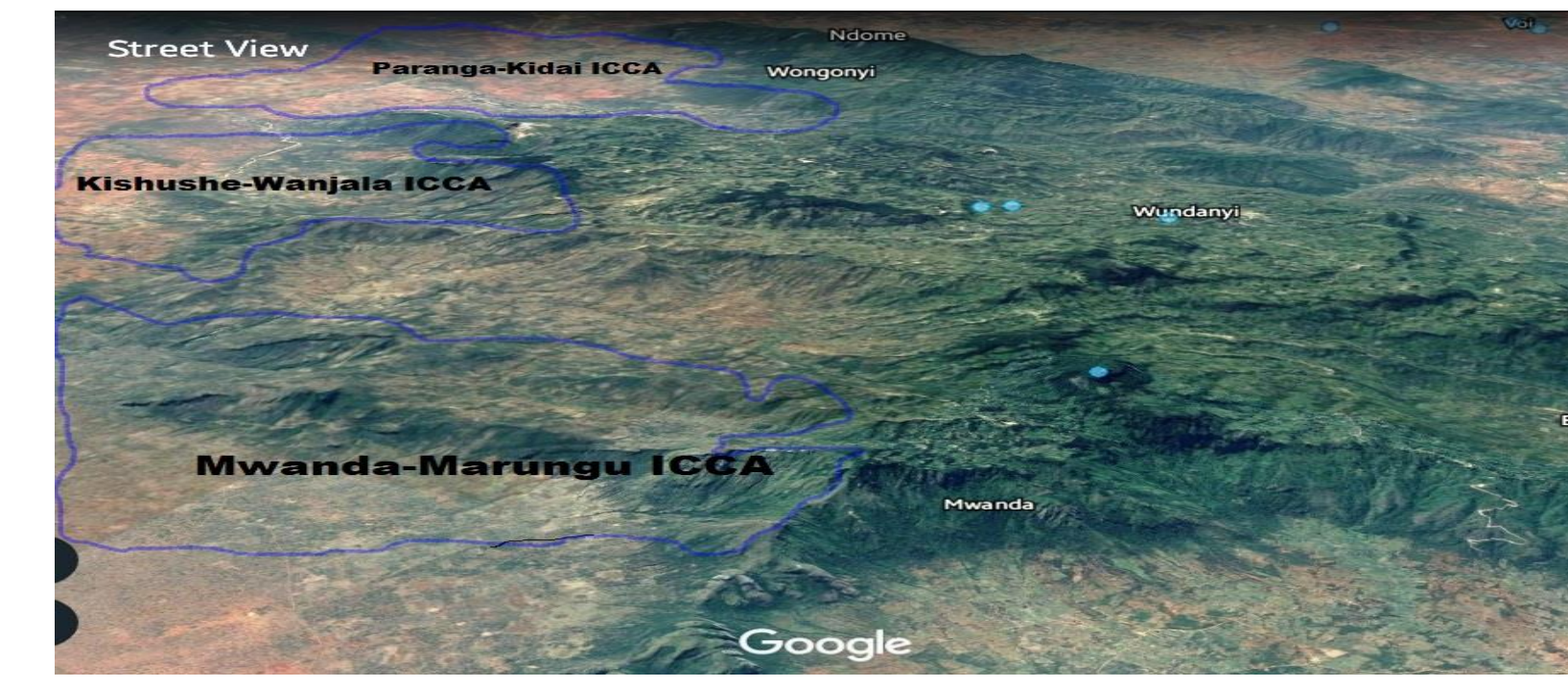
Map 2 and 3: The map of Kenya indicating the study area (on yellow spot); and GoogleEarth map image of Taita hills indicating three ICCAs

Ethnographic methods: participant observation and semi-structured interviews with validation of data conducted through fifteen-sessions of focus group discussions of between 6 to 10 respondents per session. Sample size n = 234 , data organized in themes/domains as described by CBD's Aichi Target 11 guidelines and explored whether the identified pastoral commons fit the criteria of ICCAs and OECMs. This included field visits to the common territories themselves and de visu landscape analysis