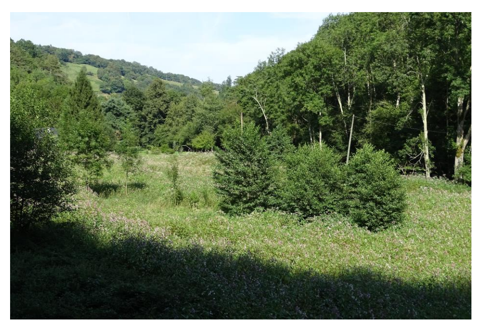
Fig. 2. Abandoned meadow, totally invaded by Impatiens glandulifera and subject to spontaneous reforestation

Most interviewees, especially the elderly, identified the slate quarries as the cradle for the development of the invasive alien species currently present in the valley, through the extensive movement and transport of soil and rock. The subsequent cessation of slate quarry activity left large areas of "disturbed" schist that would then have favoured the installation and dispersal of these species. The spread of IAS to the forest understorey as well as to the agroforestry plots and meadows was facilitated because the vegetation was no longer managed through the agricultural activity. The abandonment of agroforestry practices gradually facilitated IAS invasion in the landscape. However, none of the respondents were able to assess the process and rapidity of the invasion by IAS more precisely.