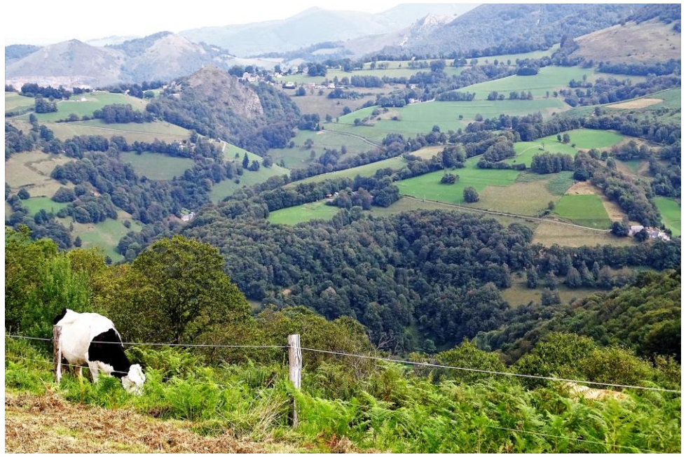
Fig. 3. Traditional agroforestry landscape in a process of abandonment materialized by the expansion of tree components in the fields, and the presence of brambles, bracken and invasive species like Spiraea japonica (Upstream of the Oussouet valley, Labassère, Hautes Pyrénées).