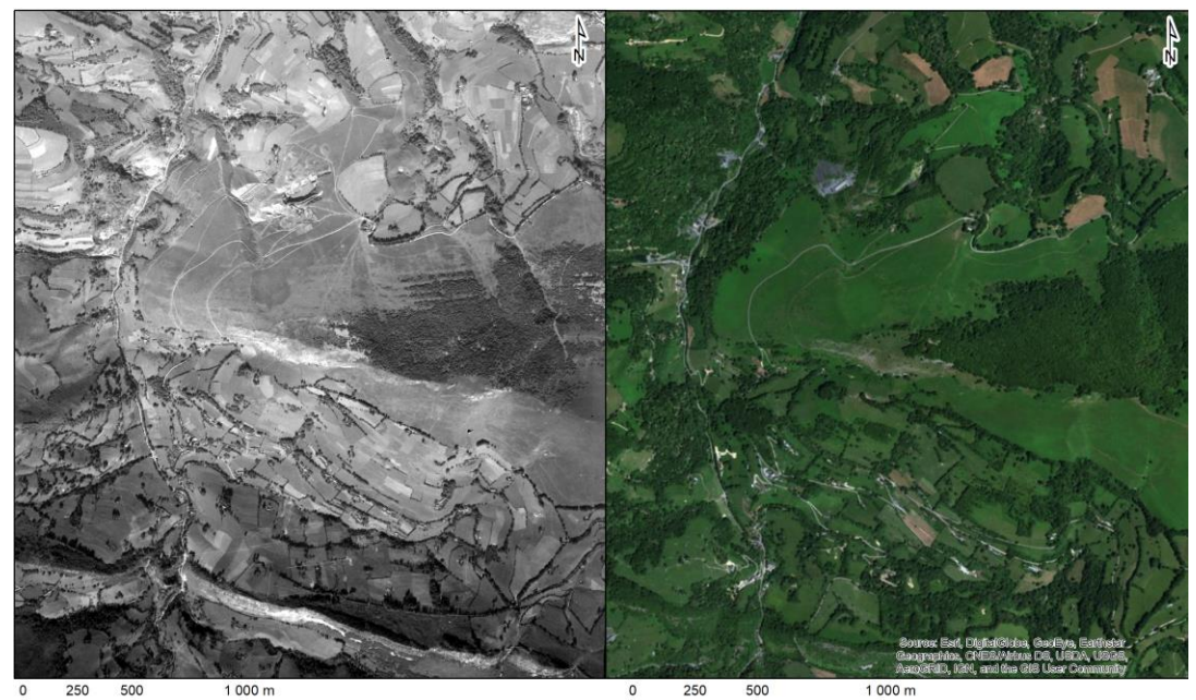
A/ Aerial photography - 1948