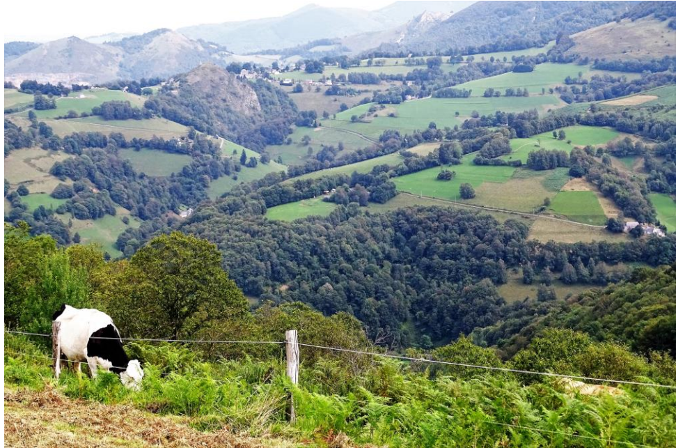
Fig. 3. Traditional agroforestry landscape in a process of abandonment materialized by the expansion of tree components in the fields, and the presence of brambles, bracken and invasive species like Spiraea japonica (Upstream of the Oussouet valley, Labassère, Hautes Pyrénées).