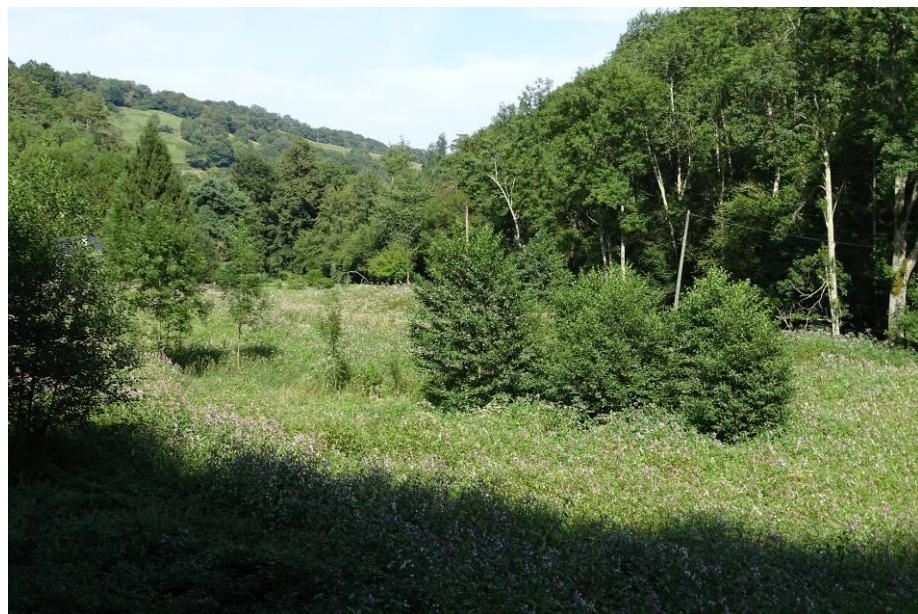
Fig. 2. Abandoned meadow, totally invaded by Impatiens glandulifera and subject to spontaneous reforestation

Most interviewees, especially the elderly, identified the slate quarries as the cradle for the development of the invasive alien species currently present in the valley, through the extensive movement and transport of soil and rock. The subsequent cessation of slate quarry activity left large areas of "disturbed" schist that would then have favoured the installation and dispersal of these species. The spread of IAS to the forest understorey as well as to the agroforestry plots and meadows was facilitated because the vegetation was no longer managed through the agricultural activity. The abandonment of agroforestry practices gradually facilitated IAS invasion in the landscape. However, none of the respondents were able to assess the process and rapidity of the invasion by IAS more precisely.