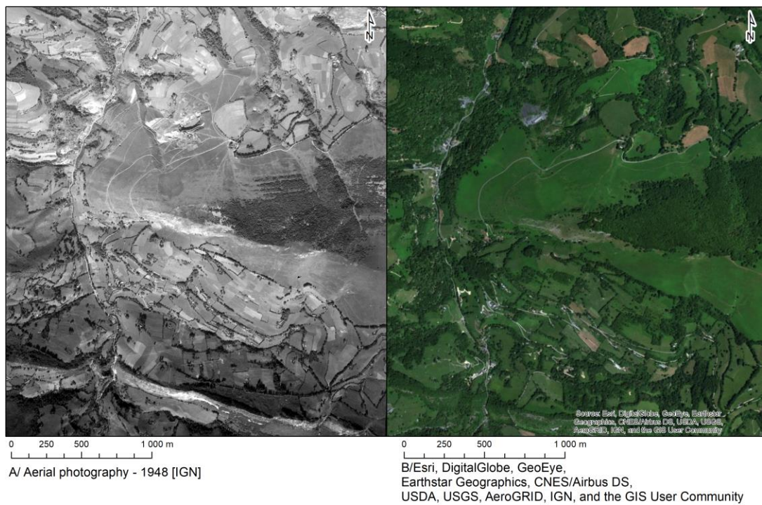
Fig. 4. Evolution of traditional agroforestry landscapes of the Pyrenees (Oussouet valley, Trébons village, France, 1948-2016). The “landscape closure” process by natural afforestation (B, 2016) is a result of the previous agricultural and pastoral activity (A, 1948) that maintained them and avoided their being abandoned, which also favoured overgrowth by various invasive species.