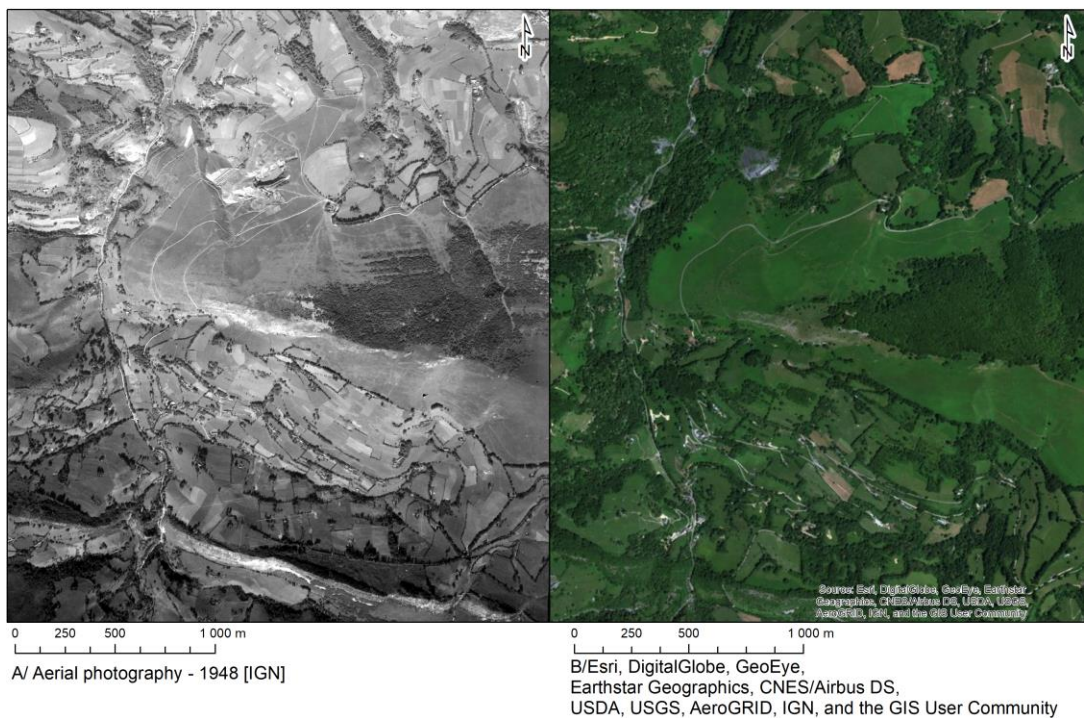
A/ Aerial photography - 1948 [IGN]