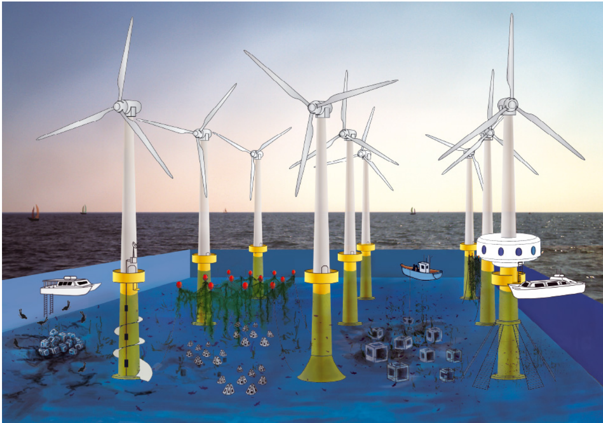
Fig. 2. Example of multi-use management of a wind farm. The wind turbine density is artificially high to facilitate the presentation of the concept. From left to right: diving, scientific studies, aquaculture, fishing, tourism.

of all the ways and means to maximize the usefulness of it for all stakeholders (Pioch et al. in press). The evolution in the design and management of marine construction could contribute to a reduction in their negative impact. Actually, it has been estimated that habitat destruction remains the first cause of biodiversity loss for 67% of endangered marine species (Bœuf 2008).