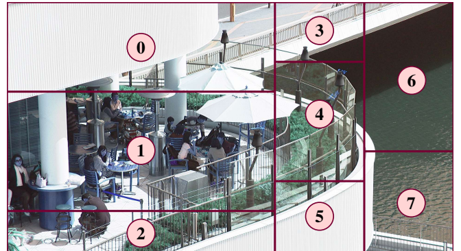
Fig. 2: TRS partitioning of BQTerrace frame #4, computed with slice clustering.

As mentioned in Section 1, prediction dependencies across RSs boundaries are disabled and entropy coding state is reinitialized at each RS. In order to limit the encoding quality loss induced by these restrictions, the optimal TRS partitioning P^* gathers similar spatial information inside the same RSs. This corresponds to a K-mean clustering [17] of the spatial information into the RSs, further called RS clustering. The RS clustering searches the TRS partitioning P^* that minimizes the sum of luminance variance on all RSs. Eq. 2 computes the partitioning P^* where p_i is the value of luminance samples, and \mu_j is the mean of RS s_j luminance samples.