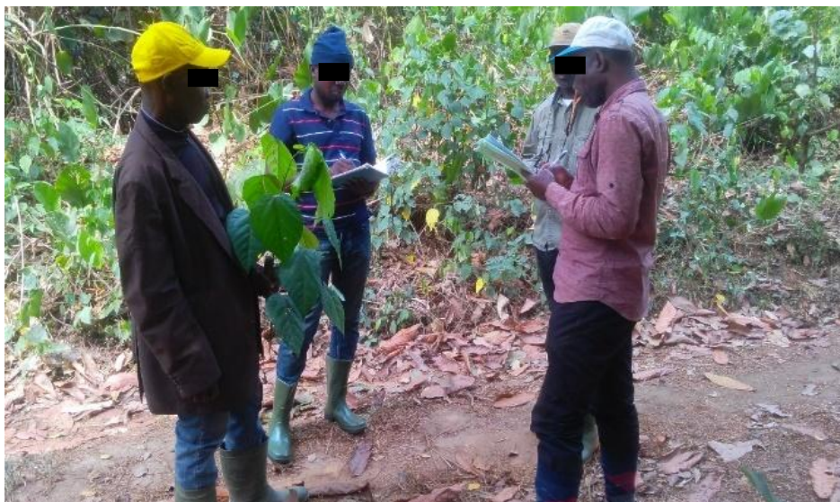
Fig. 2. Plant identification and collection

Both herders and traditional practitioners defined diarrhoea as fluid and repeated stools. In case of diarrhoea, farmers give the leaves to the animals as food. For humans, in case of diarrhoea, plants (leaves, bark and/or roots) are mostly used as decoction and oral administration remains the most frequent way of administration of plant recommended by healers.