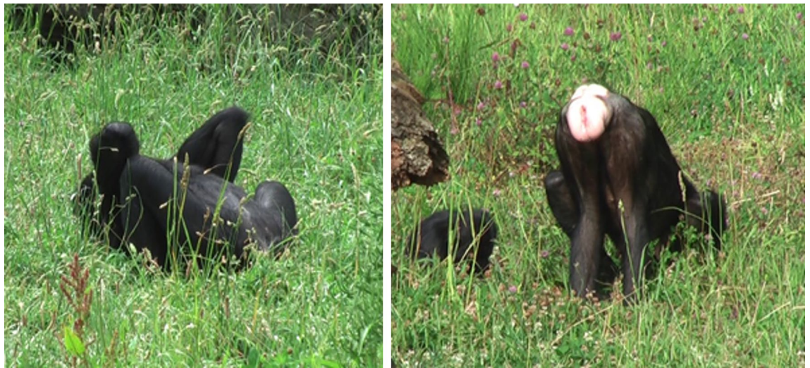
Figure 1. Full-crouch (left) and forelimb-crouch (right) postures.

female socio-sexuality. A species-specific behavioural trait promoting female cohesion 11,12 is genito-genital (GG) rubbing, in which two bonobo females embrace each-other face to face and rub their genitals together by moving them side to side 13 . Considering the social significance of sexual swelling in this species, it is reasonable to hypothesize that any behaviour enhancing the perceptiveness of this signal should be positively selected.