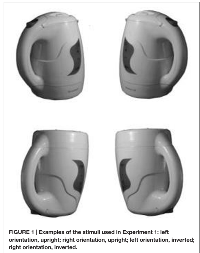
FIGURE 1 | Examples of the stimuli used in Experiment 1: left orientation, upright; right orientation, upright; left orientation, inverted; right orientation, inverted.

During the task, they were required to indicate as quickly as possible whether the object was upright or inverted by pressing the corresponding response key. Each participant carried out two blocks of 88 trials with a break of 3 min between blocks. In one block, subjects were to respond with their right hand for upright objects and their left hand for inverted objects. In the second block, they were asked to do the opposite – to respond with their right hand for inverted objects and their left hand for upright objects. The order of these blocks was counterbalanced between subjects. Within each block, 44 randomized trials were primed by the participant's surname and the other 44, by the imaginary surname "Rani." Before carrying out each block, the subject was informed that his surname would appear before objects as if he owned them or the surname Rani would appear before objects as if Rani owned them, and