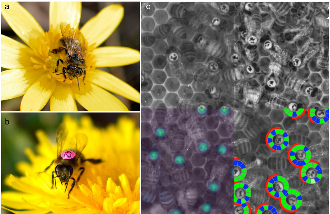
Figure 1. Recording bee behaviour in the hive and at the hive entrance. Bees can be marked with uniquely identified a radiofrequency identification (RFID) tags, b coloured number tags or c 2D bar coded paper tags on their thorax for individual recording of their social interactions (on the comb) and foraging activity (at the hive entrance). c In this example, behavioural tracking was used to analyse honey bee waggle dances. Top left: original image. Top right: pre-processed image. Bottom left: ‘localiser’ step for which the position of the tags is identified. Bottom right: ‘decoder’ step for which the 2D bar code is decoded thus providing the orientation of each individual bee. Red semi-circle indicates the front of the bee, green and blue sections represent the binary code (12 bits) identifying the individual.

Efficient colony foraging relies on the coordinated activities of up to hundreds of workers