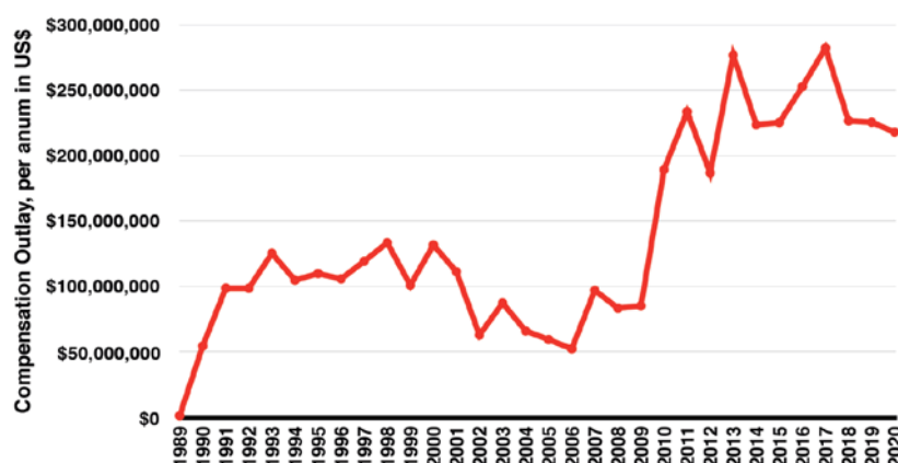
Figure 1. Vaccination injury compensation paid under the US VICP (1989-2020) [Data source: 12].

fees of claimants). Total payouts per annum for the past eight years under VICP have fluctuated within the range of US$200 million to US$300 million per annum (Figure 1). The highest total annual payout was $282,099,306 (in 2017). It appears that the vaccine injury expenditure of the VICP is funded within the vaccine tax revenue stream (of the excise levy of US 75 cents per disease per vaccine dose).