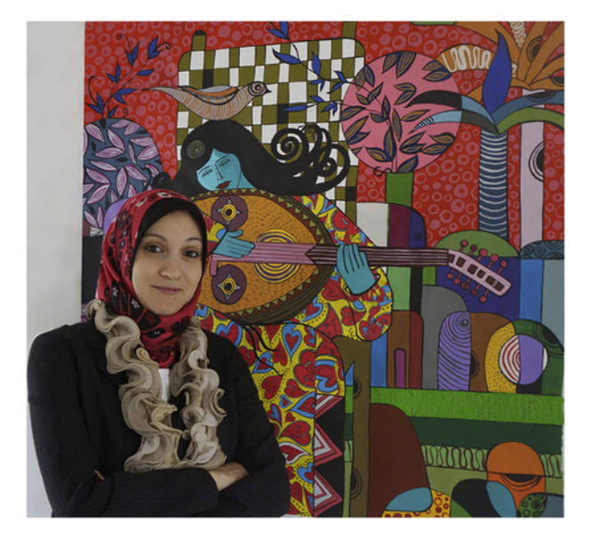
Fig. 1. Dina Matar, Contrary to what women like, Oil on canvas, 2011, © Courtesy of the artist.

nage, he crosses the city carrying an "M" and gathers testimonies from passers-by. Subsequently, he imagines an RER (suburban Paris rail) line connecting the various cities of the fragmented Palestinian territories (Jerusalem, West Bank and Gaza).