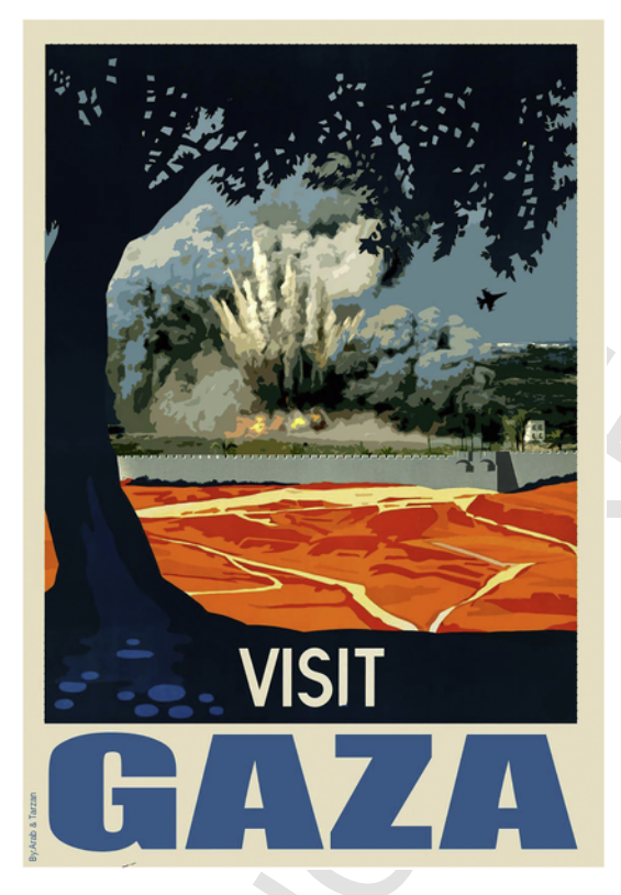
Fig. 7. Arab and Tarzan Nasser, Visit Gaza , Digital Poster, 2014 (inspired by Visit Palestine poster, by Franz Kraus, on the right), © Courtesy of the artists.

to live normally and we want peace". What emerges with this young generation of artists is a social criticism of the traditional "top-down" institutions and of the representatives holding power.