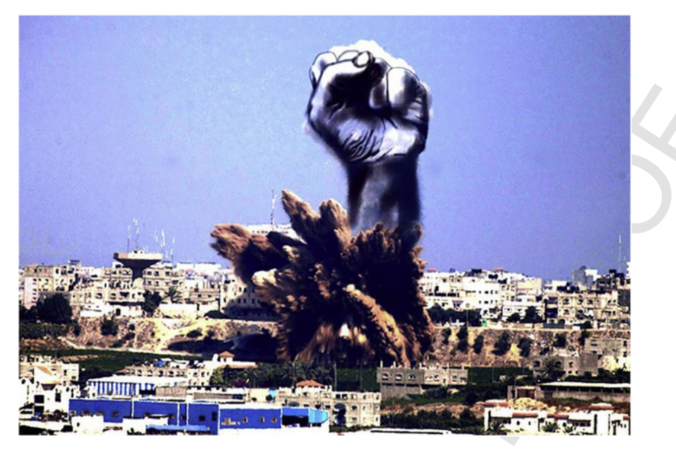
Fig. 6. Belal Khaled and Tawfiq Jebreel, Smoking art, Gaza, 2014, © Courtesy of the artists.