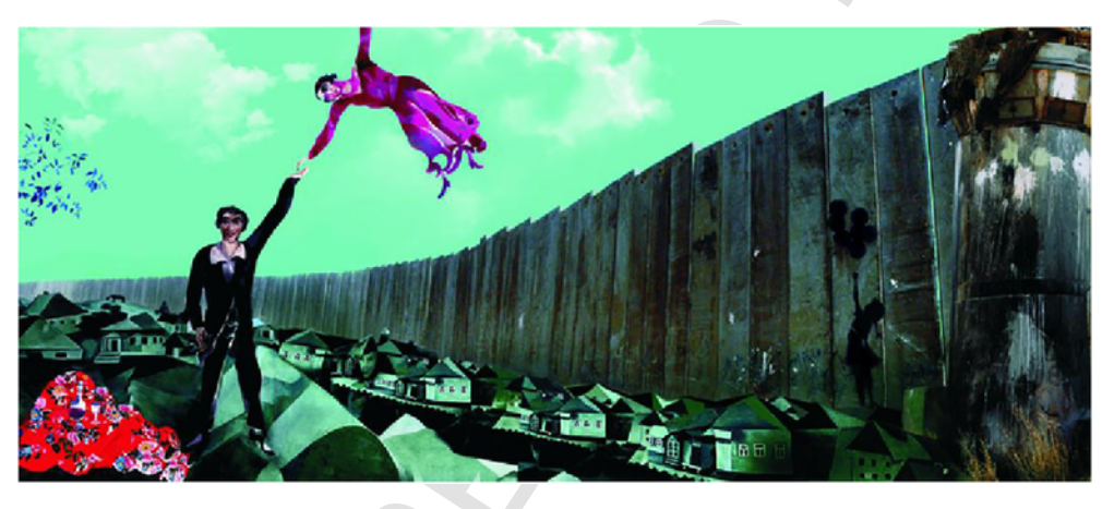
Fig. 10. Mohammed Hawajri, Guernica Gaza, Digital art, 2010, © Courtesy of the artist.