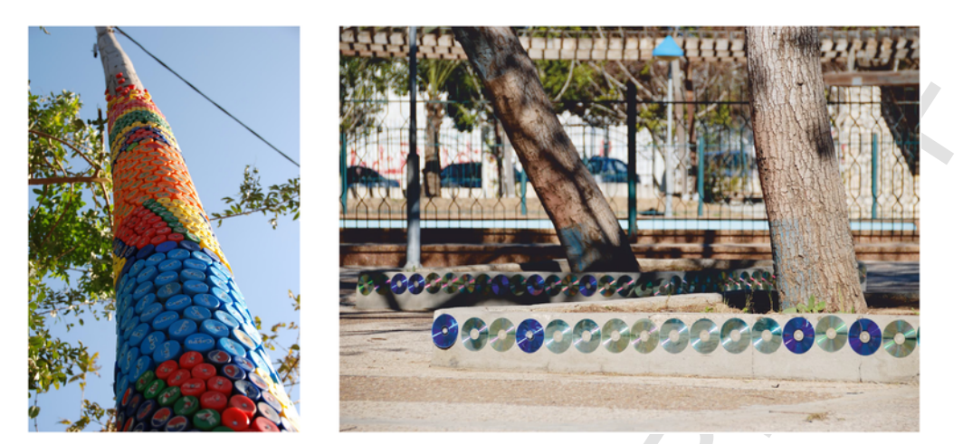
Fig. 4. Mohammed Musallam, Art in public space, Mix media/Urban art, 2013 © Courtesy of the artist.

Fig. 3. Mohamed Abusal, A metro in Gaza, Multimedia installation (photography, paper, signs), 2011, © Courtesy of the artist.