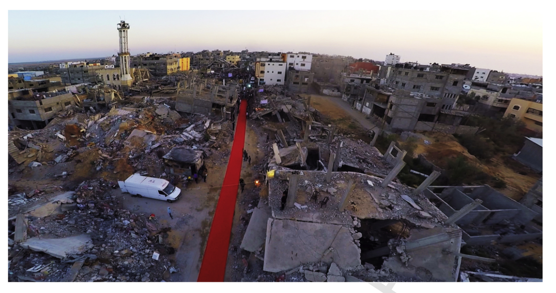
Fig. 12. Khalil Mozaien (Lama Studios), Gaza Red Carpet Film Festival, 2015, © Courtesy of the artist.