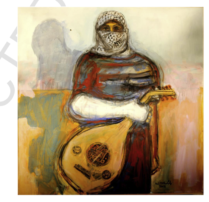
Fig. 8. Raed Issa, The musician fighter, Oil on canvas, 2010, © Courtesy of the artist.

Against this backdrop of a rupture with conventional political processes, the artist's engagement is moving from purely nationalist art towards universalism, whereby art is considered as a struggle for human rights. This transition was brilliantly illustrated at the latest Gaza film festival, "Karama Gaza Red Carpet Human Rights Film Festival" [Fig. 12], launched by film director Khalil