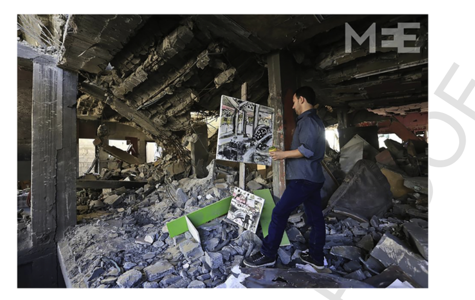
Fig. 9. The artist Raed Issa painting in the ruins of his destroyed house after the Gaza war of summer 2014.