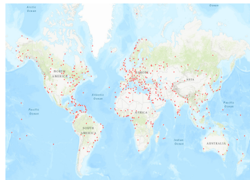
Figure 2 The main global component