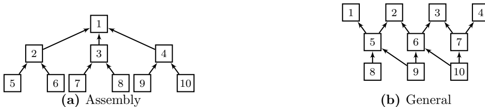
Figure 2: Considered BOM.

We generate two test beds. First, the main experiments are performed with a test bed derived from the series A of Tempelmeier and Derstroff (1996). As these instances were designed for the deterministic MRP with zero lead times, they are extended (as explained in the Electronic Companion) to include the demand’s probability distributions and lead times. Three sets of instances are considered: (1) 1,026 classical instances are generated with full factorial design from the parameters given in Table 4; (2) 48 instances with small distribution support are generated with an assembly BOM (see Figure 2), a binomial distribution, and with full factorial design from the parameters (other than BOM and distribution) indicated in Table 4. (3) 20 instances with a large planning horizon are generated with lead times randomly chosen in [0, 3] , a time horizon of \hat{T} + 10 periods, and various values for the other parameters. Second, to evaluate the performance of the fix-and-optimize approach for large-scale supply chain planning problems, we generate a second test bed from the data in Willems (2008) as explained in the Electronic Companion.