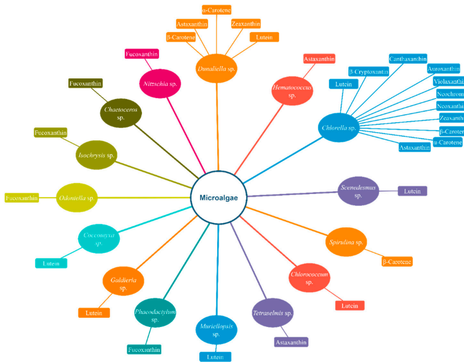
Figure 1. Several famous microalgae and the carotenoids produced by them. Only carotenoids produced at a high amount are mentioned in the diagram.