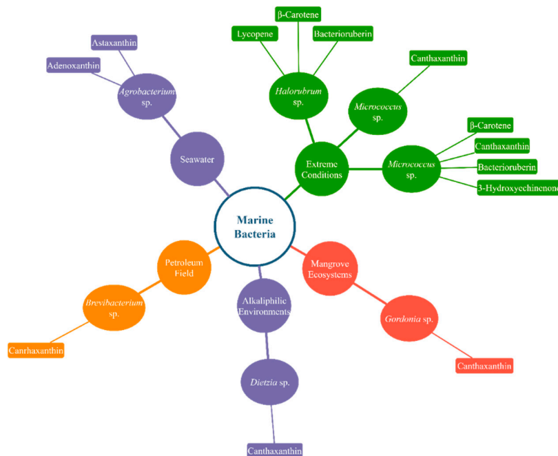
Figure 2. Various carotenoid-producing marine bacteria and their natural growth condition. Only a few well-known marine bacteria and the carotenoids they produce at a high rate are featured in the diagram.

To this day, the in vitro synthesis of carotenoids has maintained their mass production. Nevertheless, the developing present-day standards for nature-loving routines and a healthy way of life have offered a search for natural bio-compounds as alternatives to synthetic ones. Recently, microalgae and bacteria biomass are being utilized as naturally accessible carotenoid sources. This is a great new way forward, in contrast to the in vitro synthesis of carotenoids, which is costly and