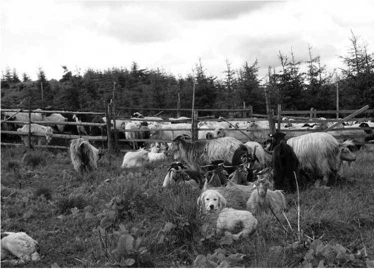
FIG. 4. Herd grazing in the mountains near Strâmbu-Băiut.