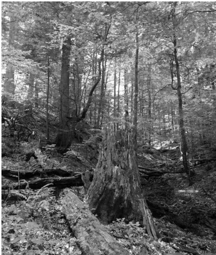
FIG. 6. UNESCO protected forest site.

The highest concentrations of trace metals (mainly Pb and As) are measured contaminant in both valley bottoms and near mining wastes. Trace metal concentrations remain high in forest soils, but values are decreasing in the areas furthest from the mines. The on-going multi-proxy study of the peat records suggests evidence of TM atmospheric pollution prior to the modern times, which may confirm long mining history in the region (A. Petras, PhD research) and its possible legacy on in present-day forest soils. The numerous remains of CK terraces ( n=80 ) detected in both modalities of each forest site, including in the UNESCO core zone, provides evidence for past fuelwood harvesting to supply former smelters. The spatial distribution of the CKs (mainly