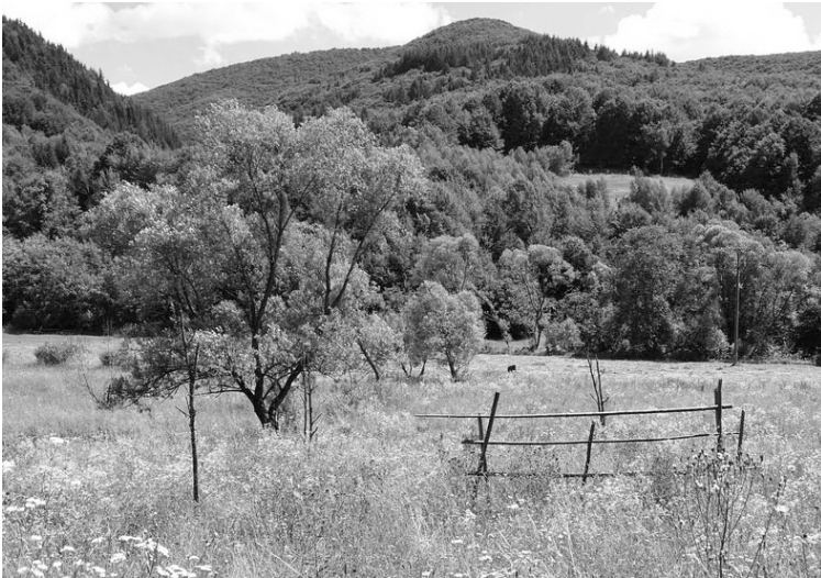
FIG. 3. Mowing meadow near Poiana.

in the two valleys (sheep, cows, horses, goats), but in a less developed way in Băiuț than in Poiana. In Poiana, humid grasslands of the bottom of the valley (Fig. 3) and dry grasslands of mountainsides are farmed by mowing or grazing. Small herds graze trimmed mountain pasture areas in summer (Fig. 4), but during the last 30-50 years, the volume and intensity of this activity were probably most important. In Poiana, the mining legacy is subtler and large areas of mining waste are far from the village, which has preserved its rural authenticity (Fig. 5). The UNESCO forest site is mainly located in the southern half of Poiana valley offering a showcase closer to the ideal natural image (Fig. 6).