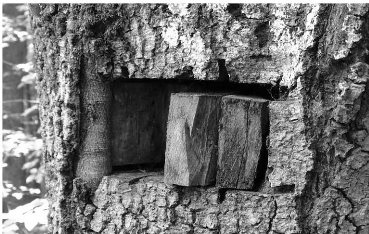
FIG. 7. «Testing notches» in a living tree trunk (credit: S. Guillerme).

The examination of the OGF modalities evidences subtle traces of past timber harvest, including in the UNESCO core area. The remnants from former logging operations such as slash, sections of abandoned logs, stumps at different decay stages and remains of logging corridors are preserved in different places. In Poiana OGF numerous «testing notches» are also detected, mainly on living silver fir trunks but also on beech and sycamore ( Acer pseudoplatanus L.) (Fig.7).