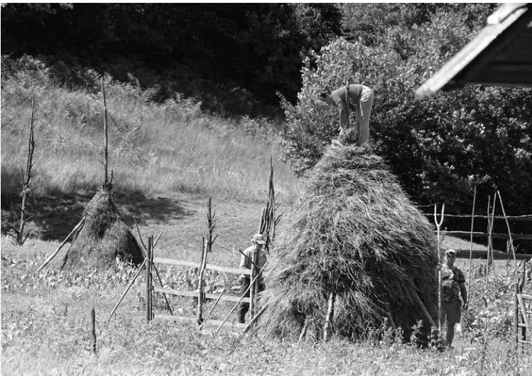
FIG. 5. Poiana, a village that has maintained a strong agricultural economy.