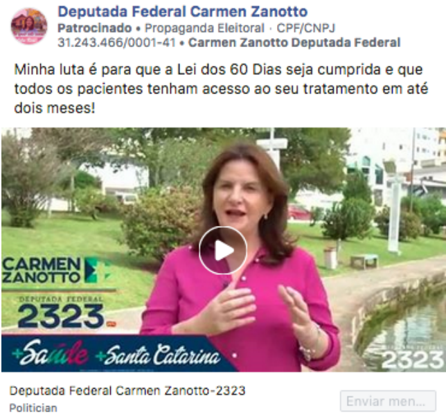
Figure 1: Example of an official political ad posted during the election period in Brazil.

We implemented several machine learning-based techniques for detecting political ads on Facebook. We tested supervised classifiers such as Naive Bayes, Random Forest, Logistic Regression, SVM and Gradient Boosting as well as a recently proposed Convolution Neural Network (CNN) built to detect political tweets. To evaluate our algorithms we created a golden standard test collection with