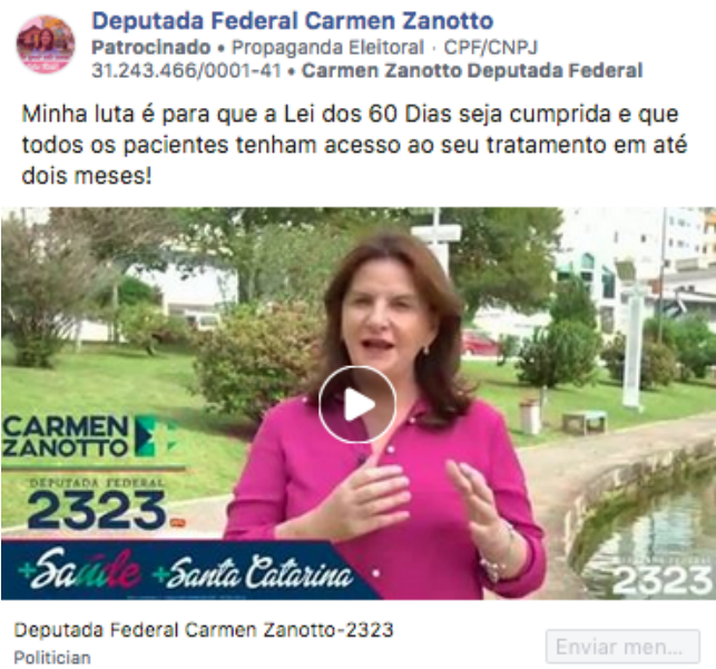
Figure 1: Example of an official political ad posted during the election period in Brazil.

We implemented several machine learning-based techniques for detecting political ads on Facebook. We tested supervised classifiers such as Naive Bayes, Random Forest, Logistic Regression, SVM and Gradient Boosting as well as a recently proposed Convolution Neural Network (CNN) built to detect political tweets. To evaluate our algorithms we created a golden standard test collection with