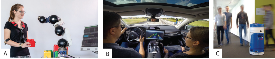
Figure 2: Examples of applications in which our methods are already used. (A) Provably safe human-robot interaction. (B) Guaranteeing safety in autonomous driving. (C) Office robot whose safety is certifiable due to our approach; image provided by courtesy of Bosch Research.

fashion and for verifying whether these decisions are safe. The search space for these safe decisions can be efficiently pruned using reachability analysis.