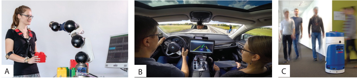
Figure 2: Examples of applications in which our methods are already used. (A) Provably safe human-robot interaction. (B) Guaranteeing safety in autonomous driving. (C) Office robot whose safety is certifiable due to our approach.

fashion and for verifying whether these decisions are safe. The search space for these safe decisions can be efficiently pruned using reachability analysis.