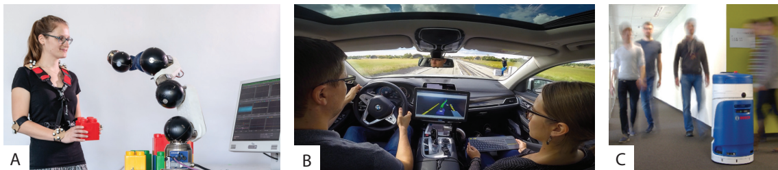
Figure 2: Examples of applications in which our methods are already used. (A) Provably safe human-robot interaction. (B) Guaranteeing safety in autonomous driving. (C) Office robot whose safety is certifiable due to our approach; image provided by courtesy of Bosch Research.

fashion and for verifying whether these decisions are safe. The search space for these safe decisions can be efficiently pruned using reachability analysis.