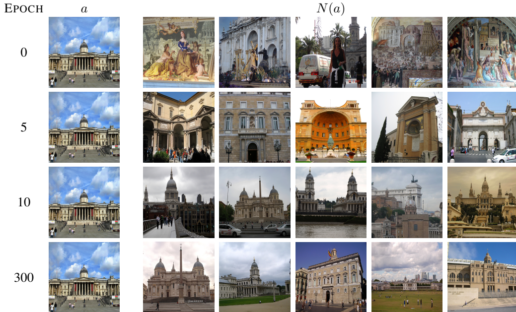
Figure 2: Asymmetric hard negative mining . One anchor a shown on the first column, followed by the hard negatives N(a) mined for this anchor, over different epochs. The anchor is represented by the student and the database of potential negatives by the teacher.