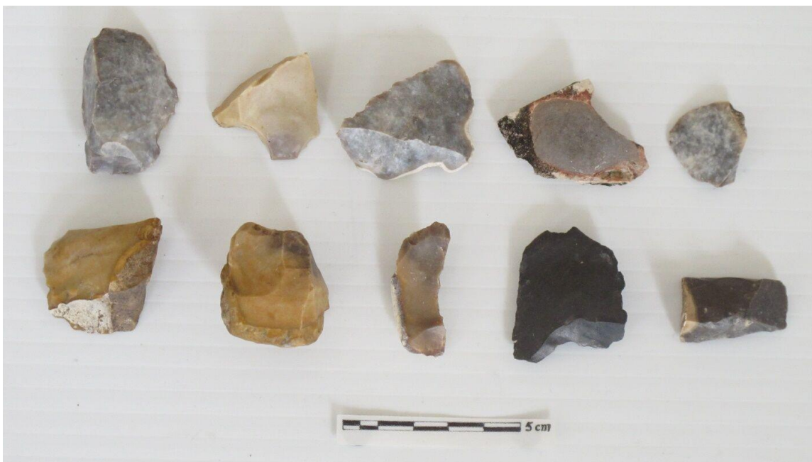
Figure 4. Lithic Flakes from the River, Burton's Field and Cattle Field sites.

Even if all three sites present similar lithic collections, the River site presents significant post-depositional alteration. While 24% of the flakes of River showed white patina and none showed traces of contact with fire, 72% of the Burton's Field and Cattle Field combined flakes had a heavy patina and 20% showed signs of prolonged exposition to high heat. The heavy patina, especially on some artefacts from Cattle Field, sometimes masked all traces of knapping and use to the point where it was impossible to see the original color and texture of the flake.