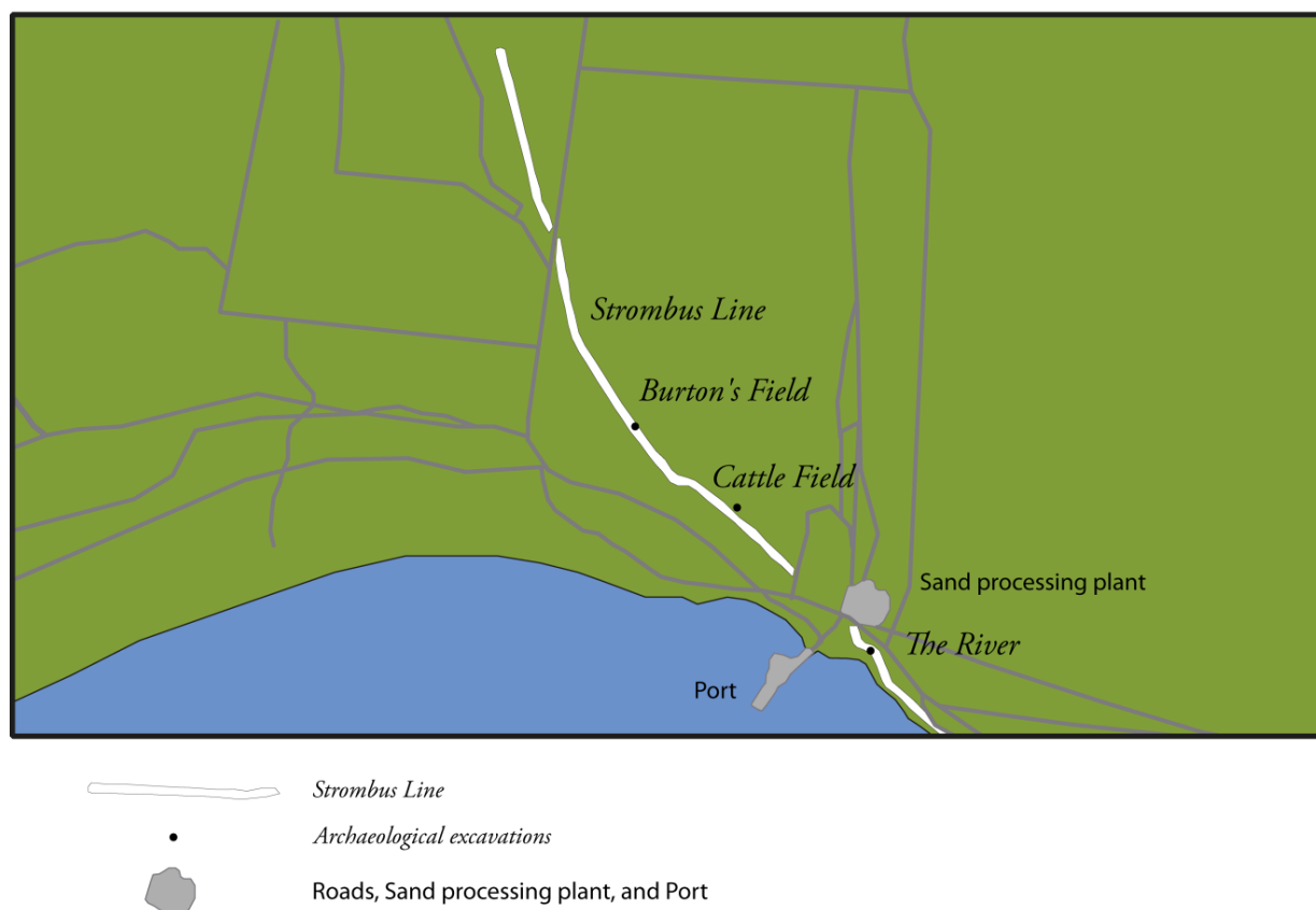
Figure 3. Map of the Strombus Line, and the River, Burton's Field (BuF 12) and the Cattle Field (CaF 12) sites.

the port in a location called the River (Figure 3).