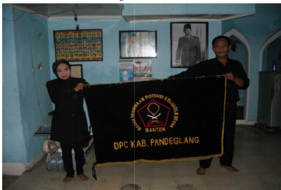
Figure 4: Representatives of BPPKB in Pandeglang, holding the banner of the organization (2011)

control the media and they prevent the rise of a political educated middle class. On the other hand, they are central to the communities to maintain strong social coherence and to build strategies aiming to take best advantage of political and power contexts. Thus, since the presence of intermediary organizations is often proportional to the fragility of social links, their study can help to understand the resilience of local communities when facing external networks pressures.