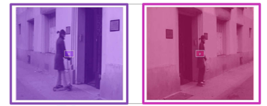
Figure 1. Example of manner-congruent (m) and path-congruent (p) AOIs in the variants presented during the similarity-judgment tasks

type and AOI-type as within-subject factors was conducted on several dependent variables (raw PM-scores, M-choices, M-fixations, etc.).<sup>1</sup>