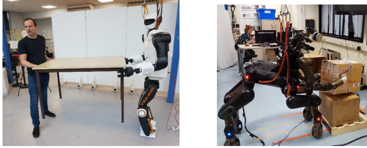
Fig. 2: The humanoid robot TALOS holding statically a table with a human in the COBOT project (left) and the quadruped Centauro moving a box with its hands Rolley-Parnell et al. (2018) (right).