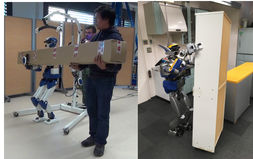
Fig. 3: (left) HRP-4 holding a large box with a human while walking (Agravante et al. (2019)) (right) HRP-2 pivoting a furniture (Murooka et al. (2017)).