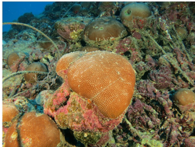
Fig. 3. Mesophotic coral ecosystems: human effects and scientific and management strategies that must be addressed to make them a conservation priority.