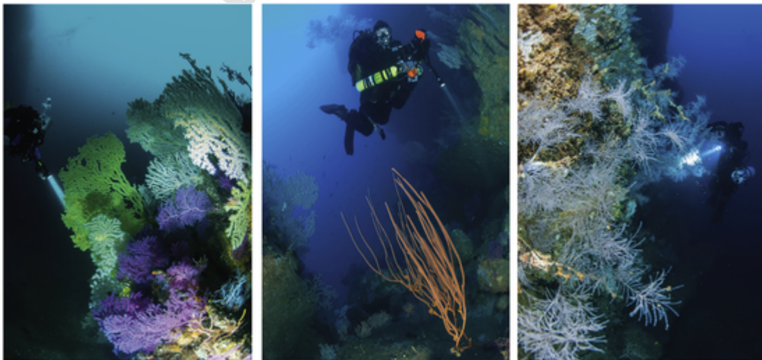
Fig. 2. Temperate mesophotic ecosystems at approximately 100 m depth in the North East Atlantic Ocean (west coast of Portugal). Left panel, assemblage dominated by large zoantheid and octocorals; center panel, a rare giant gorgonian; right panel, a rarer black coral garden.

In this review, we outline why global conservation policies must focus on heterogeneous set of MCEs. MCEs contain high levels of biodiversity; mesophotic reefs, rhodolith beds, black coral, octocoral forests, and sponge aggregations are all important and distinct seascape. MCEs are not homogeneous systems globally, but cover a number of marginal ecosystems which have distinct characteristics (species richness, functional diversity, complexity, and endemism level) that need further research and high-resolution mapping overseas.