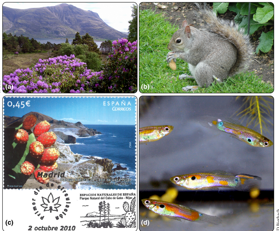
Figure 2. Examples of IAS charisma effects on biological invasions and management measures. (a) Introduction rates: introduction of pontic rhododendron ( Rhododendron ponticum ) was predominantly driven by its charisma (Mack 2001). (b) IAS charisma gives rise to public opposition to control measures: proposed control measures for introduced eastern gray squirrel ( Sciurus carolinensis ) populations in Italy were delayed and made ineffective by strong public opposition (Bertolino and Genovesi 2003). (c) IAS charisma contributes to societal acceptance of IAS: Opuntia species in Spain have become iconic symbols in the landscape, and have been depicted on stamps and postmarks. (d) IAS charisma can contribute to volunteer involvement in citizen-science projects: guppies ( Poecilia reticulata ) were promoted as flagship species of a citizen-science project directed at monitoring alien fish species in thermally polluted waters in Germany (Lukas et al. 2017).

In addition to direct experience with IAS impacts, public awareness and perception of IAS can stem from indirect