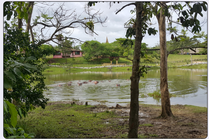
Figure 4. Feral hippopotamuses ( Hippopotamus amphibius ) in the Rio Magdalena, northeastern Colombia.

are now increasingly featured in decorative motifs in public spaces and commercial enterprises.