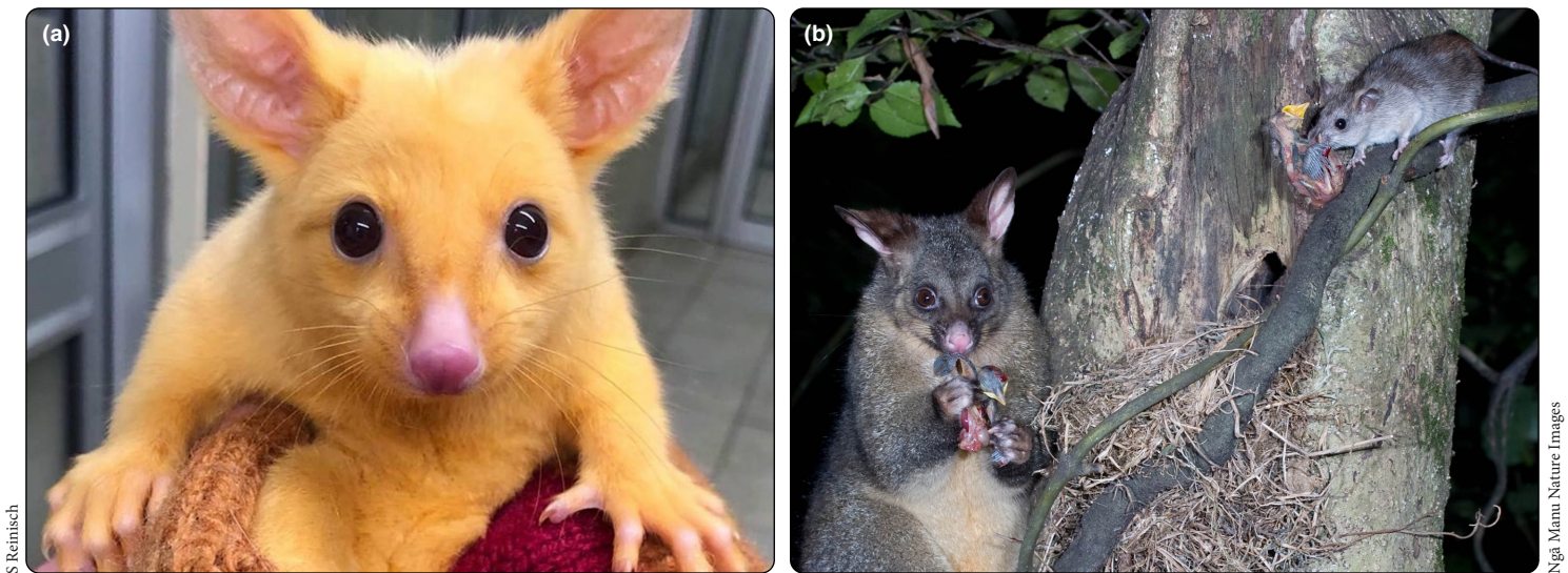
Figure 3. The way in which an IAS is presented in the media can strongly affect public perception. An example includes the common brushtail possum ( Trichosurus vulpecula ), which has been depicted both (a) positively as a “Pikachu”-like animal and (b) negatively, here with a black rat ( Rattus rattus ) as nest predators of the song thrush ( Turdus philomelos ). All three species are IAS in New Zealand.