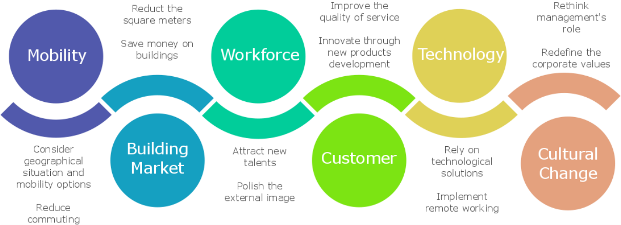
Figure 1 – Summary of the problematizing elements identified by the exploratory working group