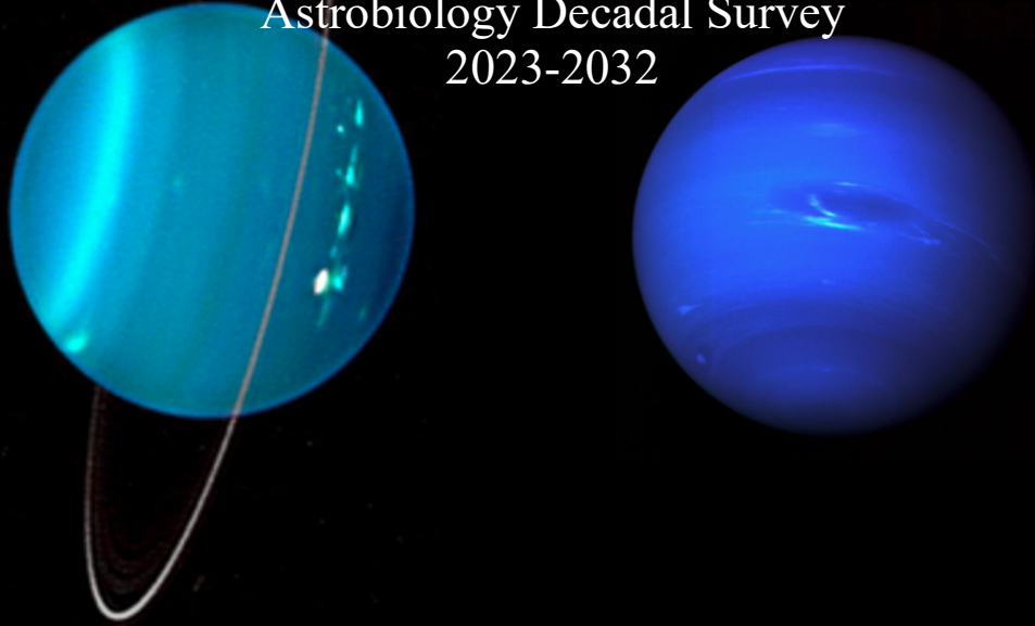
Uranus (left) [1] and Neptune (right)

A White Paper for NASA's Planetary Science and Astrobiology Decadal Survey 2023-2032