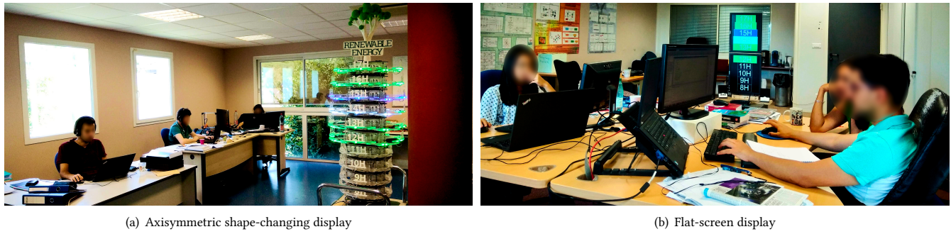
Figure 4: The two artifacts placed in the two open-plans.