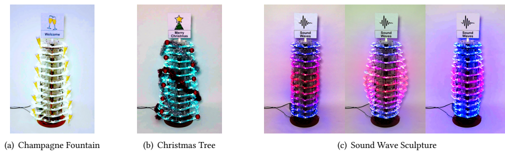
Figure 3: Examples of applications with dynamic sculptures.