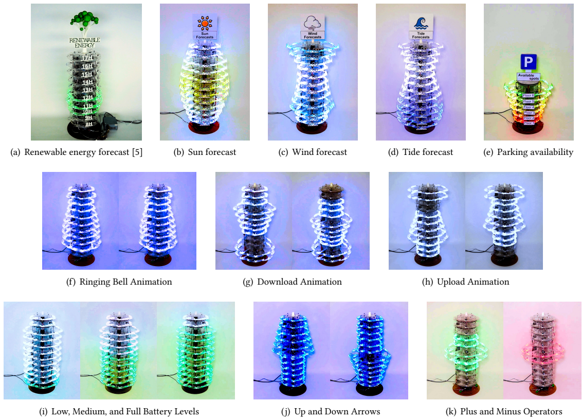
Figure 1: Examples of applications communicating information.