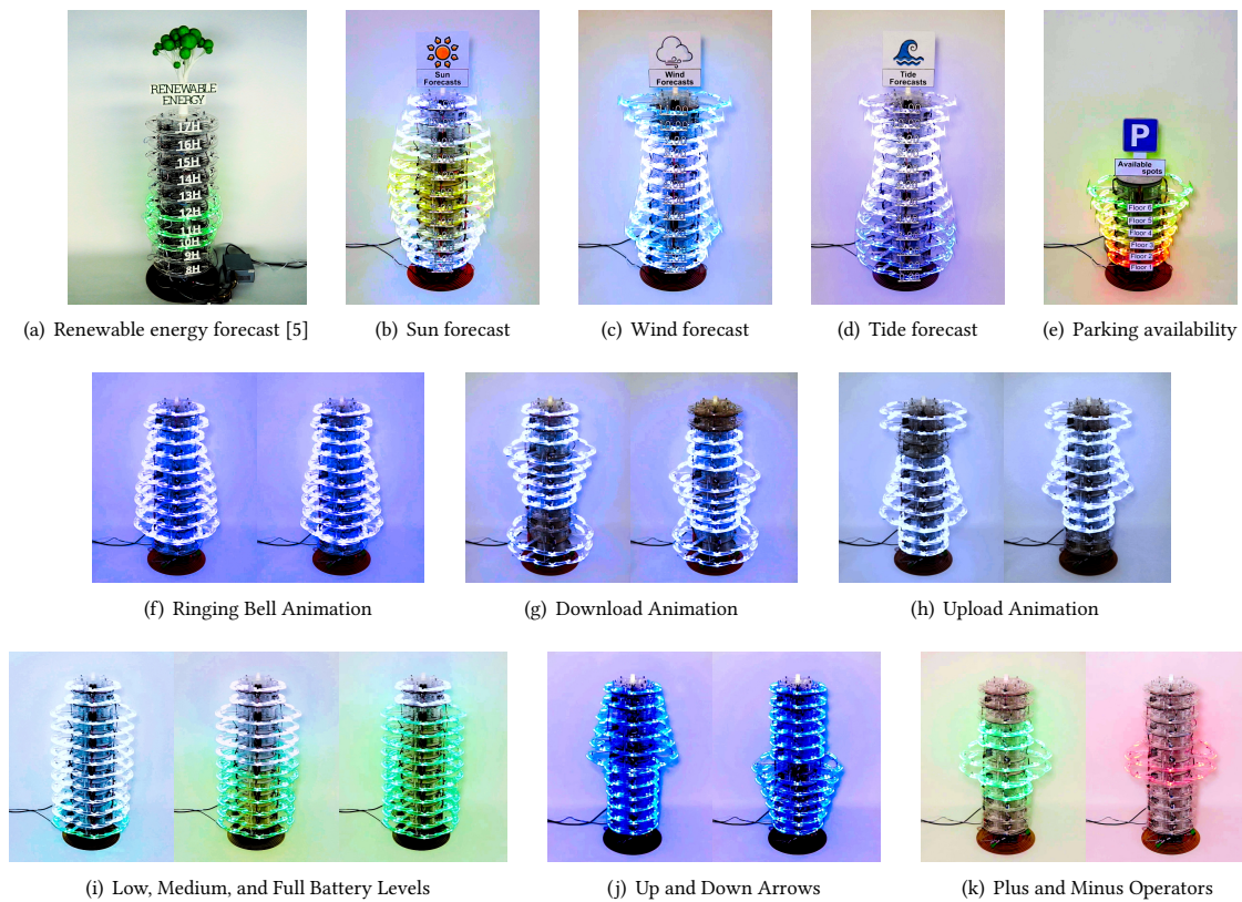
Figure 1: Examples of applications communicating information.