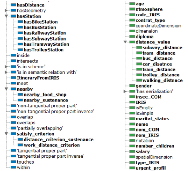
Figure 3: Fragment of properties from NAREO ontology (blue: object properties, green: data properties)

Some of the properties such as nearby or satisfy_criterion are used for the reasoning process through SWRL rules. More explanation about this reasoning mechanism is presented in the next section.