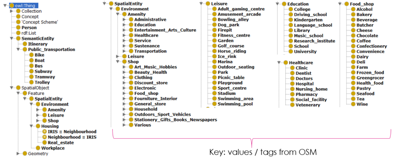
Figure 2: Partial overview of classes from NAREO ontology

information about the distance are asserted by means of data properties. In fact, the itinerary can refer to a combination of trajectories with different public transportation. Consequently, each itinerary has a combination of different distances related to different transportation. Data properties such as subway_distance , bus_distance , tram_distance are subsumed by the distance_value data property. The distance value will be communicated as a time value (trajectory duration). To clearly understand these properties and keeping in view the facts below, we can assert additional facts about distance related to the itinerary "i", for instance: