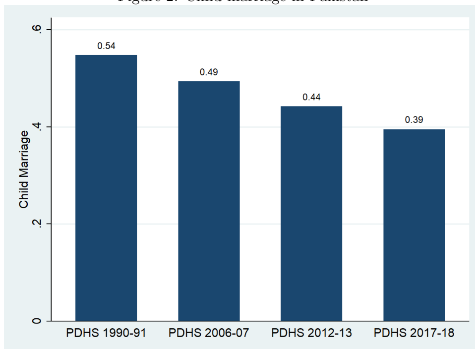
Figure 2: Child marriage in Pakistan