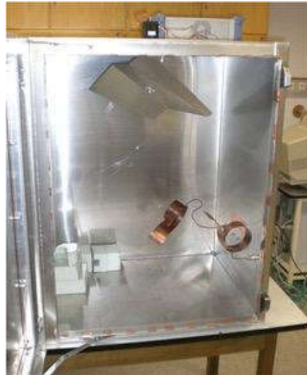
Fig.1: Small size ERC used for testing.

The relevant international standard IEC 61000-4-21 [IEC11] unfortunately recommends a minimum volume of 70 m 3 for an ERC, which exceeds the space available in most EMC laboratories and consequently restricts their applicability (see Fig. 1 for a typical example of a “small” ERC). Additional research on small scale ERCs will therefore provide smaller companies with an affordable test method. Numerical simulations of the electric fields in a small ERC are presented in [10].