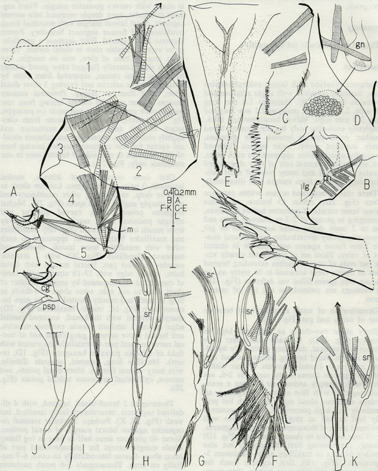
Fig. 2. - Introcornia australis , sp. nov., dissected parts of paratype (MNHN Ci 2046). A, left antennule, lateral view, segments numbered, showing musculature (medial muscles drawn with lighter striation), inset of tip of right antennule; B, labrum, lateral view; C, mandible, with enlargement of toothed edge of other mandible; D, maxillule, with enlargement of pore field (non-detailed part within dotted circle obscured by muscle); E, maxillae, posterior view; F-J, right thoracopods 2-5, respectively, showing musculature; K, left thoracopod 2, setae omitted, showing musculature more clearly than F; L, left furcal ramus, medial view. Key: cg, claw guard; gn, ganglion; lg, medial languette; psp, proximal sensory process; sr, seminal receptacles.