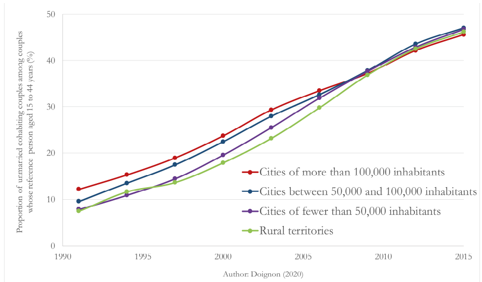
Figure 5: The hierarchical diffusion of nonmarital cohabitation (1991–2015)

Note: The indicator is age-standardized using the Belgian population in 2003 as reference population. The identification of the urban hierarchy is based on population in 2015. For the distinction between cities of fewer than 50,000 inhabitants and rural areas see Luyten and Van Hecke (2007) and Van Hecke et al. (2009). Source: Belgian National Register.