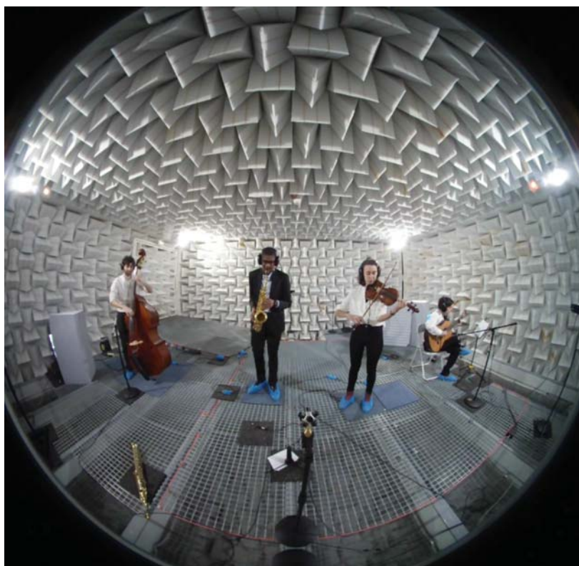
FIGURE 5. AN ANECHOIC CHAMBER recording session of a quartet. (Adapted from www.lam.jussieu.fr/Projets/AVAD-VR ; photo by David Thery.)

The HOA stream is then “decoded” for either loudspeaker array or headphone reproduction. Similarly, equirectangular images must also be processed for either projector screens surrounding the listener or an HMD