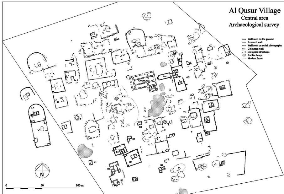
Fig. 3: Map of the central part of Al Qusur in 2011. (By J. Humbert)