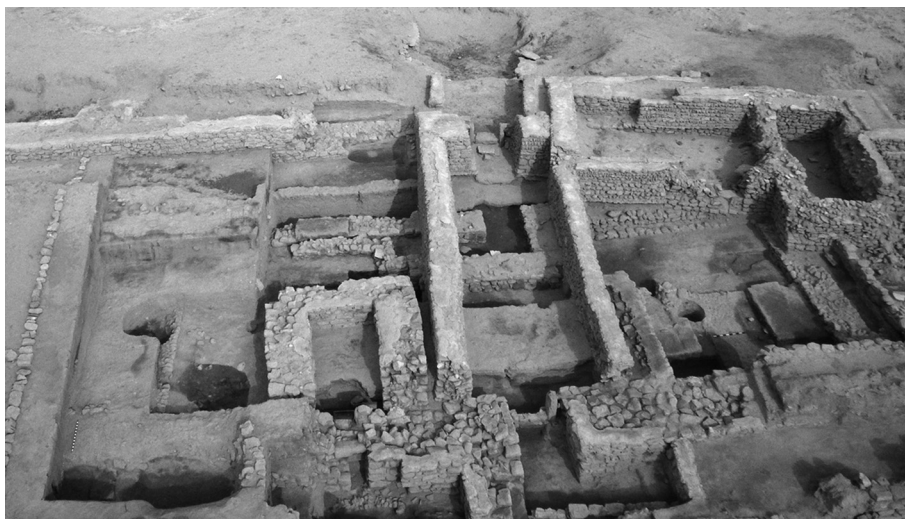
Fig. 5: The sector north of the gate of the first rampart. On the left of the corridor, A1 sector (stratigraphical trench between the first and the late ramparts); on the right of the corridor, C3 sector, inside the bent-axis walls. Note the deep soundings from the previous expeditions inside the corridor, all around the first north gate, inside the tower, and in all the C3 sector. Note also the recently cemented parts: the corridor and tower walls. View to the north.