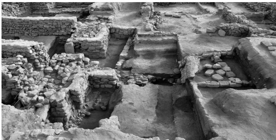
Fig. 6: A2 sector, view to the east. On the left, the first rampart and its gate. The deep soundings are from the previous expeditions.