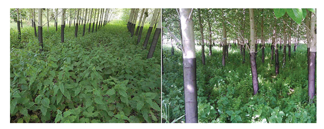
Fig. 1. Photographs of stinging nettle growing spontaneously and in a prevalent manner under short rotation coppice on metal-contaminated lands.