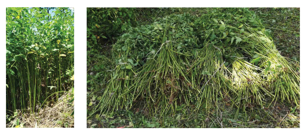
Fig. 2. Photographs of stinging nettle harvesting.

crops, such hemp, it was previously demonstrated that bast fibers and shives were not affected by TE contamination [5].