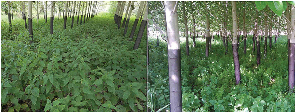
Fig. 1. Photographs of stinging nettle growing spontaneously and in a prevalent manner under short rotation coppice on metal-contaminated lands.