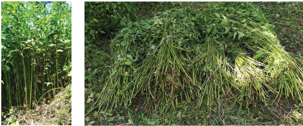
Fig. 2. Photographs of stinging nettle harvesting.

crops, such hemp, it was previously demonstrated that bast fibers and shives were not affected by TE contamination [5].